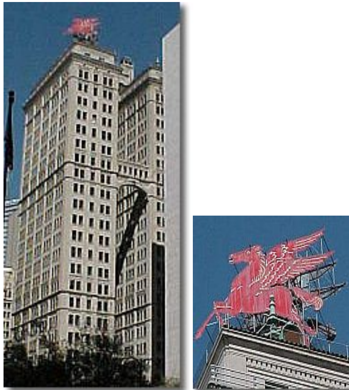
The Magnolia Petroleum Bldg.