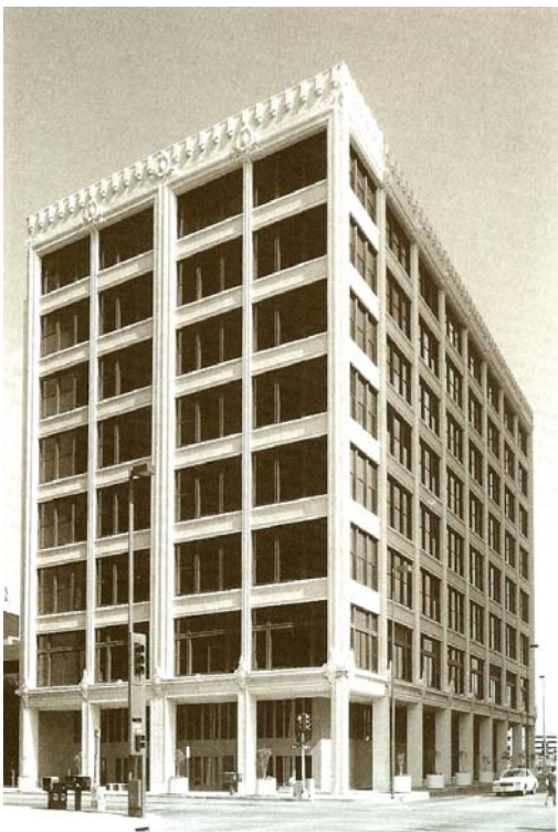
The Sanger Bros. Department Store

Architectural critics praised the use of the Prairie style in the design of this building. The use of this style was further developed in the design of many houses for prominent citizen of Dallas.