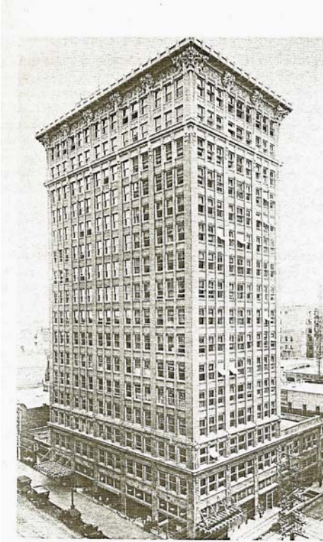
Southwestern Life Insurance Bldg.

Next Lang & Witchell designed a very significant structure: the sixteen-story Southwestern Life Building (1911), a steel framed structure which dominated Dallas until the late 1920's. This was one of the largest steel framed structures in the state, and showcased the ability of Lang & Witchell as a firm, both as architects and engineers.