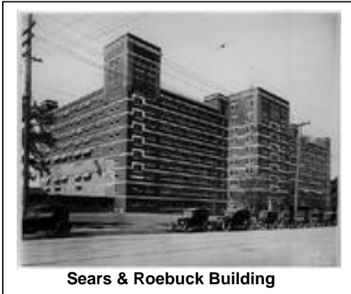
Sears & Roebuck Building

An early structure was the massive Sears, Roebuck distribution center (1913) on Lamar Avenue. Built to accommodate expansion, the original nine-story building was joined by a ten-story addition before the first phase was complete. A second nine-story addition was added in 1915. The Sears complex was said to be the largest structure in Dallas, with more than eighteen acres of floor space. These buildings were some of the first reinforced concrete structures in Dallas.